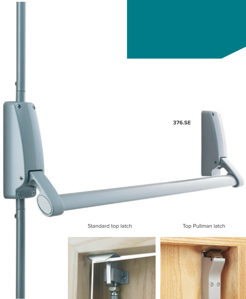
Standard top latch