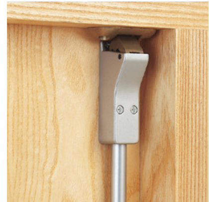
Optional pullman latches